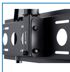
Tilt adjustment and rotation