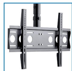
Universal mounting bracket