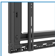
Securing the screen against falling with screws