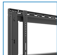
Wide range of VESA mounting standards