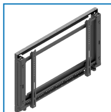
Minimalistic design and functionality