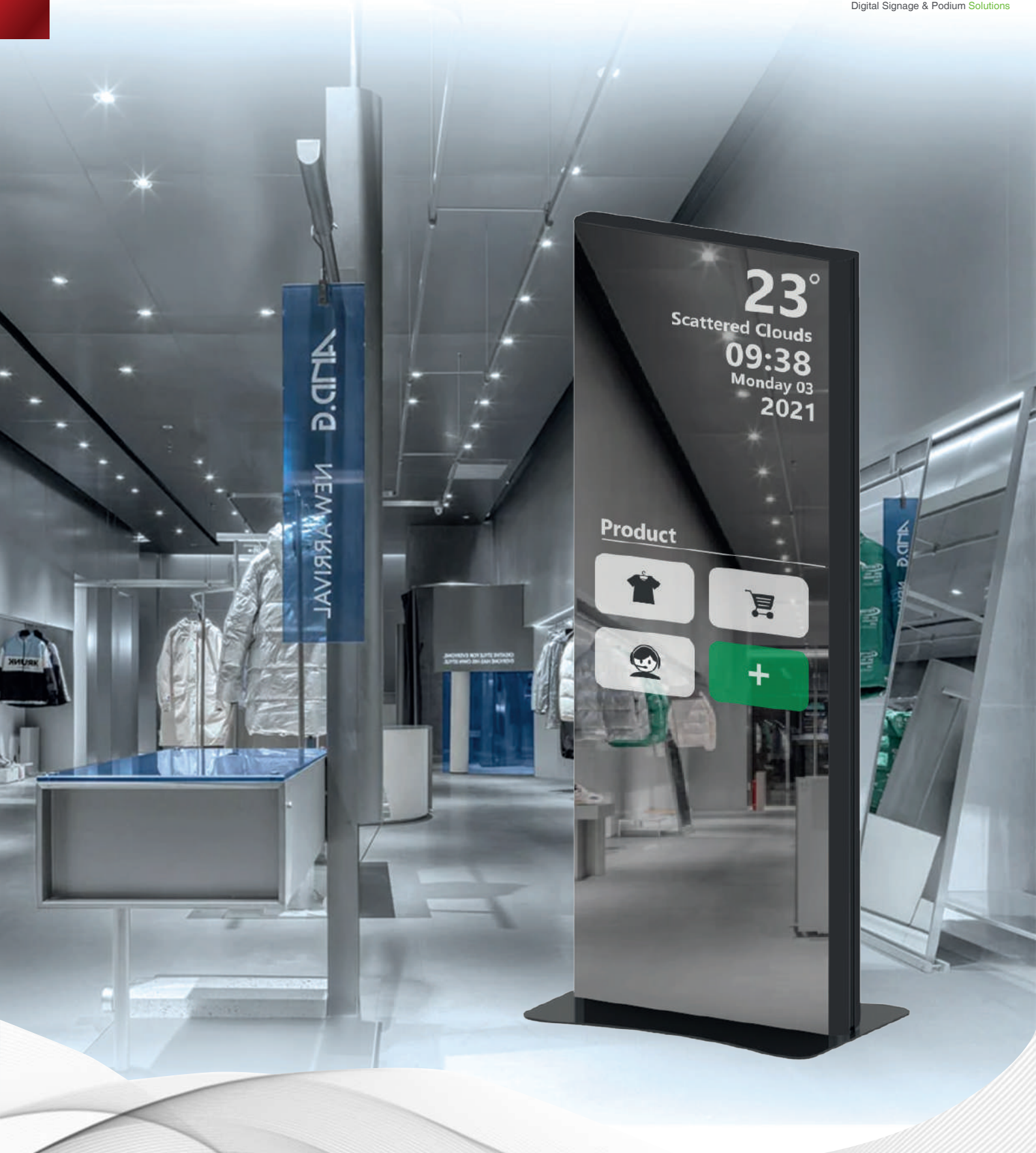
Interactive Touch Magic Mirror Kiosk